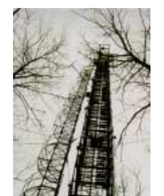
(a) AmeriFlux: The AmeriFlux network, established in 1996, includes more than 40 funded sites operating across North, Central, and South America. AmeriFlux sites constitute an infrastructure for making long-term measurements of CO<sub>2</sub>, water, and energy exchanges from a variety of ecosystems.

Air-Sea CO<sub>2</sub> Exchange: The first study of direct air-sea exchange of carbon dioxide in the equatorial Pacific Ocean was completed in 2001. This region is the largest natural oceanic source of carbon dioxide to the atmosphere. The kinetics of gas exchange