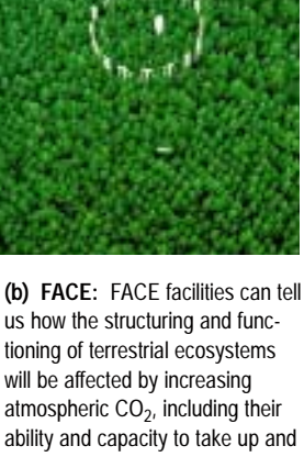
(b) FACE: FACE facilities can tell us how the structuring and functioning of terrestrial ecosystems will be affected by increasing atmospheric CO_2 , including their ability and capacity to take up and sequester CO_2 emitted to the atmosphere from human activities. FACE provides a technology by which the microclimate around growing plants may be modified to simulate climate change conditions.

(c) The Smithsonian Environmental Research Center (SERC) is conducting a series of experiments that expose portions of salt marsh and forest ecosystems to elevated CO<sub>2</sub> concentrations in outdoor chambers.